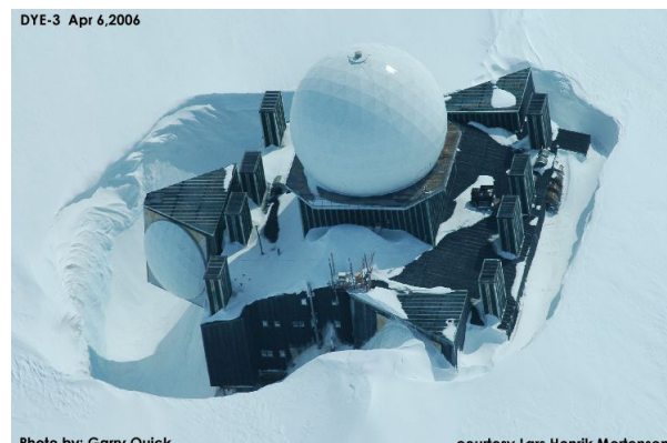
... and engulfed by it in 2006