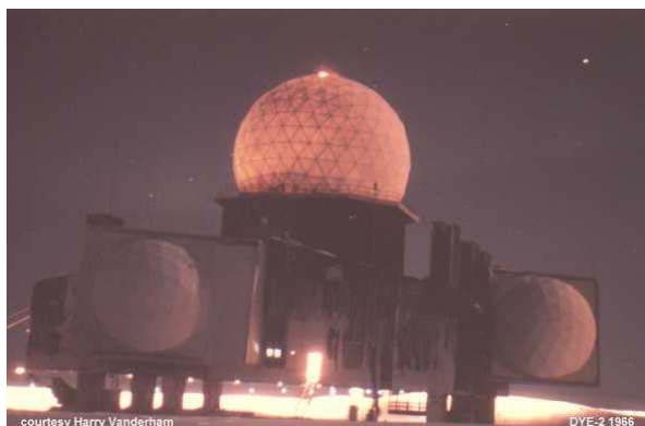
DYE-2 proud of the ice in 1966 ...