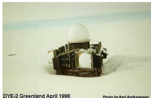
... and surrounded by it in 1998