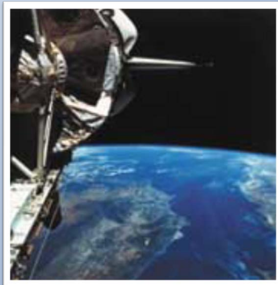
A view of the Alboran Sea (foreground) from the Space Shuttle, June 1991. Spain is at left, Morocco and Algeria on right.

The oceans warm—and cool—according to long-term physical cycles, not man-made emissions.