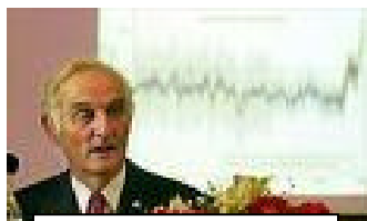
Sir John Houghton

With the replication of the hockey stick in tatters, reasonable people might have expected some sort of pause in the political momentum. Seasoned observers of the climate